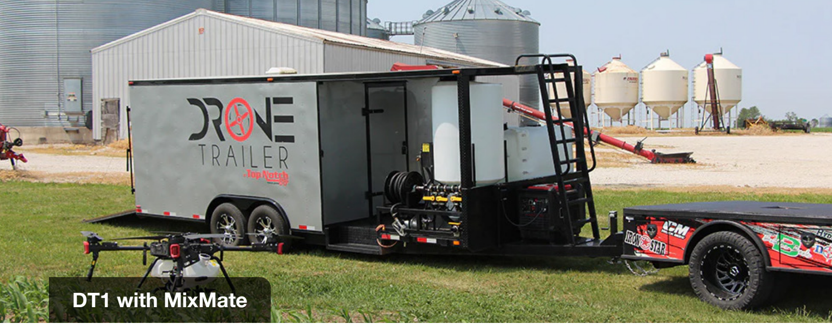
DT1 with MixMate